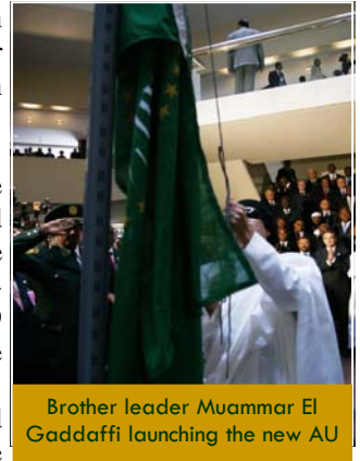
Brother leader Muammar El Gaddafi launching the new AU

At the 13 th Ordinary Session of the Assembly, the Heads of State and Government examined the report of the Panel and selected one among all the proposals. The flag is now part of the paraphernalia of the African Union and replaces the old one.