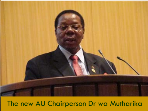
The new AU Chairperson Dr wa Mutharika

The African Union elected its new bureau on 31 January, at its 14 th Ordinary Assembly being held in Addis Ababa where the Union is based.